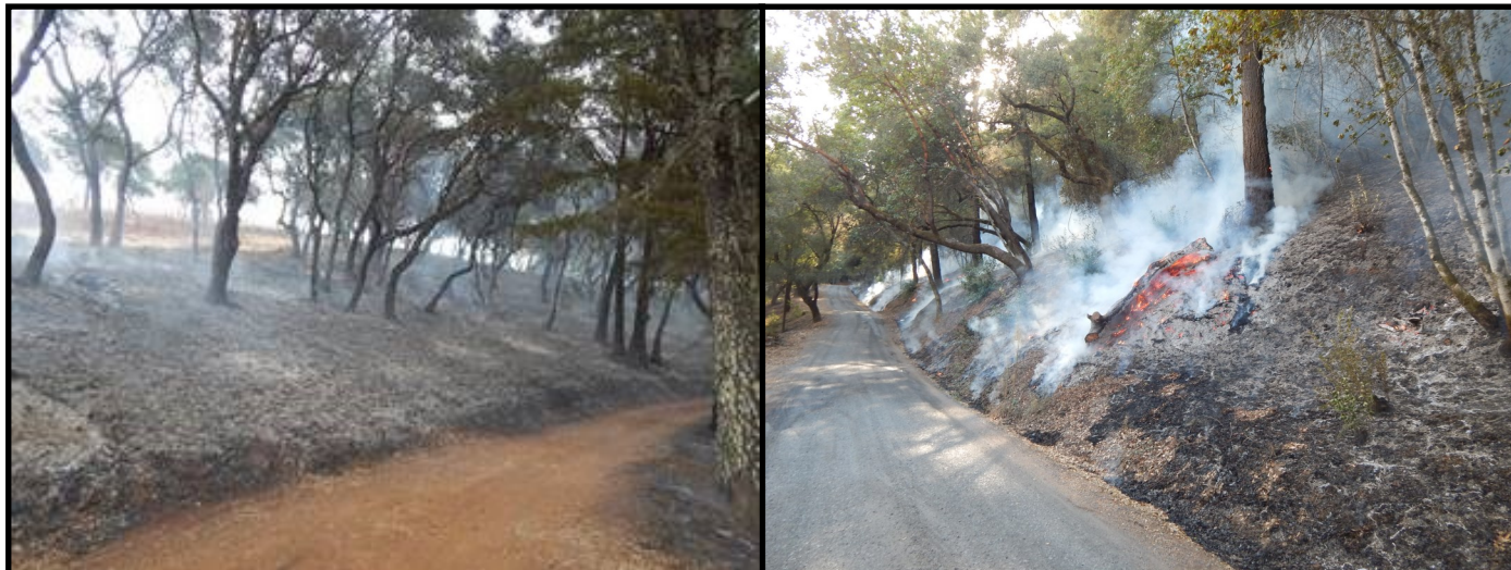
Prescribed Burn on West Dry Creek Road to Reduce Future Wildfire's Intensity