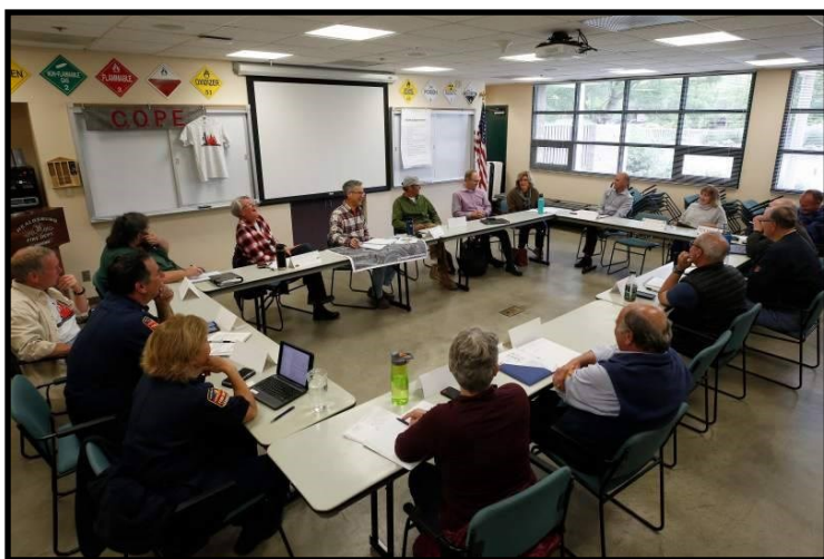
Pre-Covid-19 COPE Meeting

COPE is a grass roots effort based upon neighbor helping neighbor before, during, and after an emergency by partnering with public safety agencies to provide prevention, preparedness, and decision making information. COPE provides a forum for neighbors to meet one another and how they can help each other during an emergency when public safety agencies are stretched thin. COPE has led to prevention and preparedness improvements such as 1) development of pre-attack and neighborhood information maps which have been used during the Kincaid and Walbridge Fires, and 2) a communication link to share information about upcoming Red Flag Warnings and on-going emergencies. COPE likely has prevented wildfire ignitions.