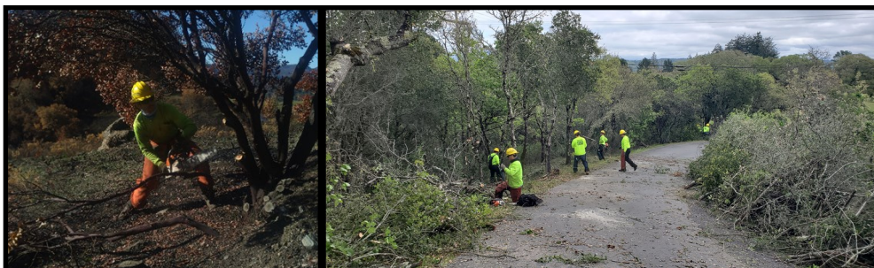
Fuels Crew Removing Vegetation along Road to create Fuel Break

The fire district formed a “fuels crew” in the Spring of 2018 to perform vegetation management (wildfire “fuels”) using CAL FIRE grant funding. The crew is comprised of part time fire district employees who are primarily volunteer fire fighters and SRJC forestry students. The crew operates chain saws and chippers to cut and chip vegetation. The crew also builds and assists with burn piles. The initial work focused on reducing vegetation along private roads and helped stop the spread of the 2019 Kincaide Fire along Coyote Ridge Road. Community donations, project sponsorships, and grants have provided funding to keep the fuel crew operational. And in the past several months fuel crew members were part of a fire district fire crew that was assigned to the Walbridge Fire for 14 days and have staffed five fire district managed prescribed burns, with over 150 acres burned. We are the only fire agency in Sonoma County with a Fuels Crew and we are proud of their work!