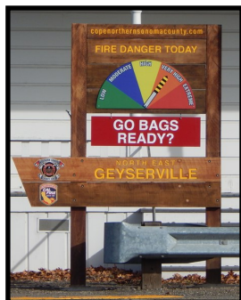
Community Fire Danger Sign

The District is always looking for opportunities to collaborate to implement fire prevention projects. During 2020, we partnered with 1) CAL TRANS to implement a vegetation management project utilizing goats along Highway 101 between Canyon Road and Chiquita Road, 2) shaded fuel break in the hills northeast of Geyserville, and 3) community fire danger signs that met the requirement for an Eagle Scout project and were funded by the California Fire Foundation.