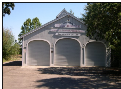
Volunteers needed in Alexander Valley to serve Station No. 2

Although the Geyserville Fire Protection District is no longer an all-volunteer fire department, volunteers are still a vital part of the program, and new volunteers are needed now as much as ever. The Department's paid staff consists of four full-time firefighters and one part-time fire chief, along with the recent addition of volunteers working paid stipend shifts. Our small paid staff is not enough to effectively cover over 200 square miles of area and run equipment from three